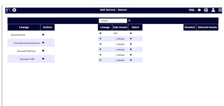
Mind Map Visualization